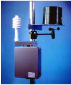
MINI FIELD STATION (MINI shown with additional sensors)

This MINI Starter Package allows the user to remotely monitor a well's water level. This starter package can be expanded to monitor the flow rate, total flow and salinity of the water being pumped. The pump can be controlled by the system, using the optional control capability on the MINI Field Station. Up to 150 Field Stations, with various configurations, can be added to this package making it a complete Data Acquisition and Control System.