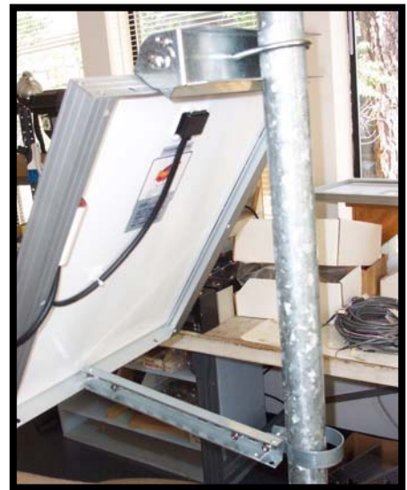
Mounting Bracket (included)